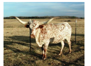
HUBBELLS I LUCKY LADY